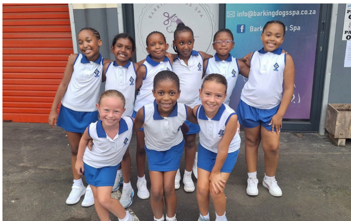
Well done to our FP girls who swam at the Midmar Mile.

Our netball girls have been competing in the Action Netball League, with both our A and B teams remaining unbeaten so far, while our FP swimmers made us incredibly proud at their first FP Gala of the year, with a special mention to our Grade 1 swimmers who bravely participated in their very first gala for Fatima.