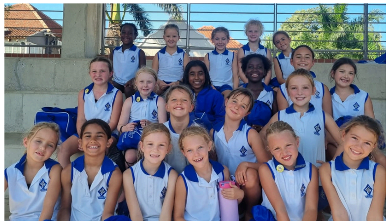
Well done to our tennis girls who played in the tennis matches at Crawford La Lucia